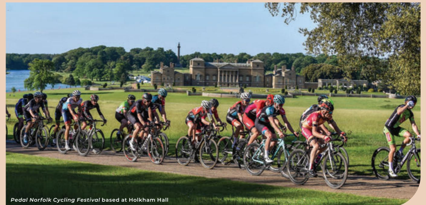
Pedal Norfolk Cycling Festival based at Holkham Hall