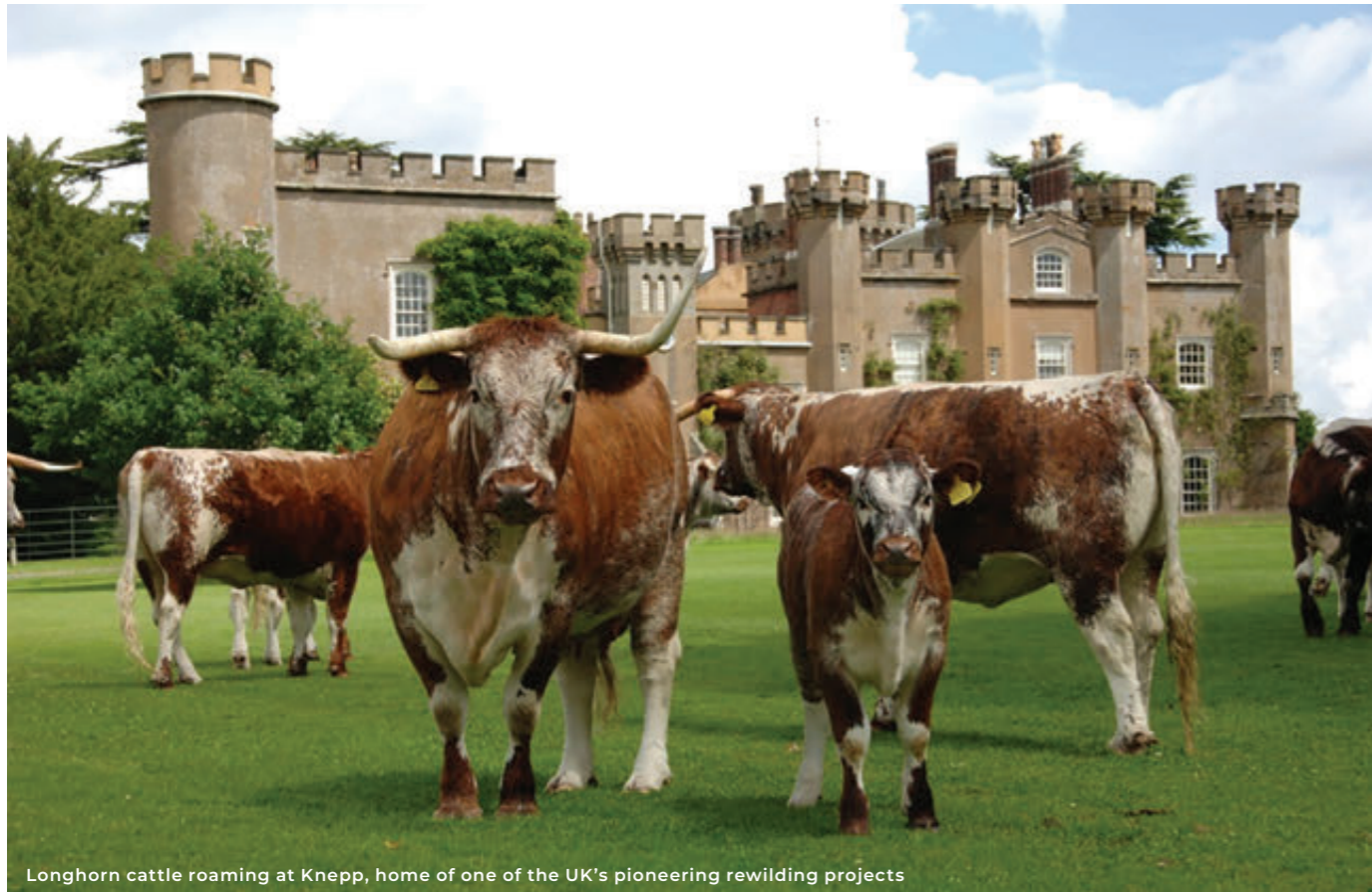
Longhorn cattle roaming at Knepp, home of one of the UK's pioneering rewilding projects

RIGHT: Solar panels on the roof of the Meadowvole Maze at Muncaster Castle. The electricity generated powers the castle's day to day needs.