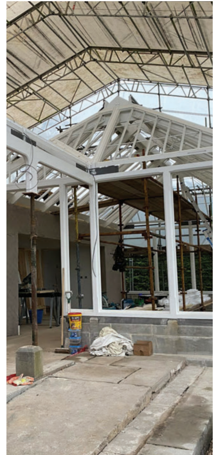
Leighton Hall's conservatory being restored using sustainable materials

“ The UK's planning system is badly in need of reform ”