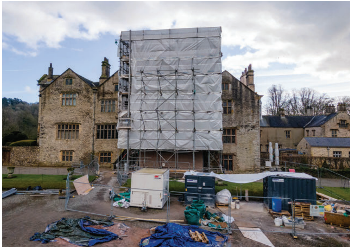
Repair and restoration works on the north tower of Levens Hall