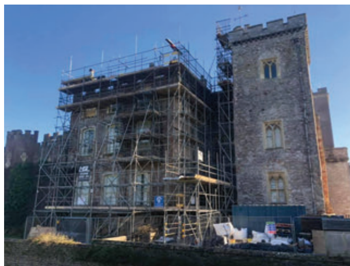
ABOVE: In the autumn of 2020, Powderham Castle received a grant towards essential restoration work on the roofs and parapets of its iconic castellated towers as part of the government's Culture Recovery Fund