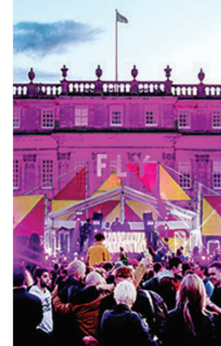
FLY Open Air Festival at Hopetoun House

To safeguard our unique and world-renowned historic houses for centuries to come, independent owners need the support of a fiscal and regulatory framework that ensures these precious buildings and landscapes are fit for the future. This report sets out why independent heritage matters — and what can be done to safeguard it for future generations.