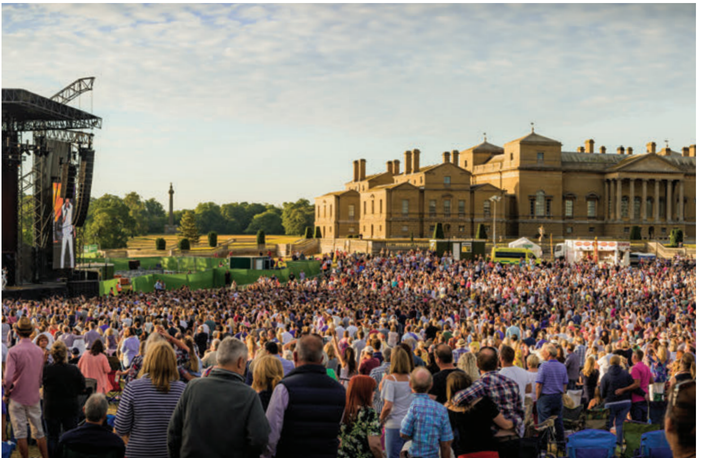
Lionel Richie performing at Holkham Hall

Historic houses for the twenty-first century