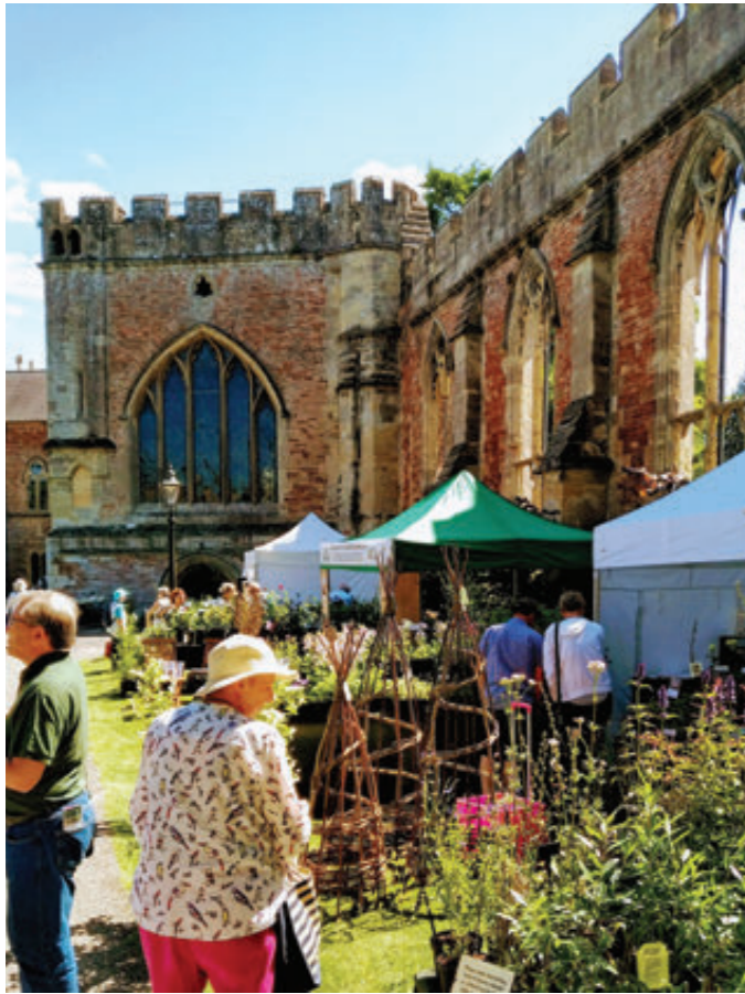
Garden festival stalls at The Bishop's Palace